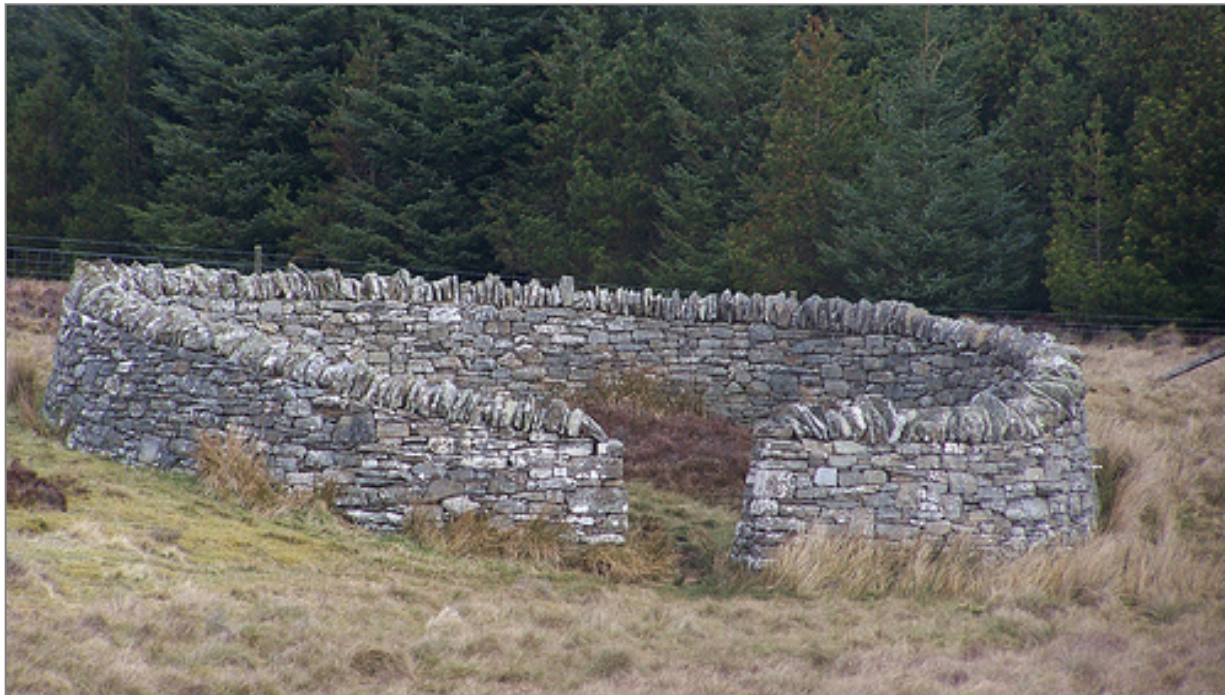
Community Sheep Pen