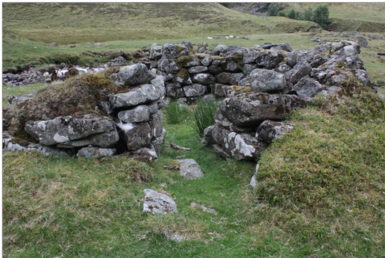
Hillside Sheep Pen